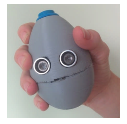
Figure 1: Prototype SenseEgg controller

The button, slider and accelerometer devices ensured that users could rapidly elicit responses to physical interactions and movement simple ensuring quick engagement in situations where attention deficit is often an issue. Inclusion of the wind sensor enables breath control, which is beneficial for users with limited limb mobility. However, this leads to the potential problem of ingress of moisture. Consequently, this further complicated package design due to the need for sealing around the wind sensor and the need for cleaning and disinfecting to prevent possible cross infection. The range finder sensor was included to provide a more challenging control mechanism as users increased their experience with the device.